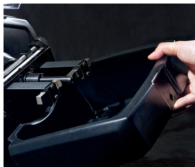
Additional waste bin