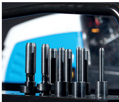
Separate tool rack