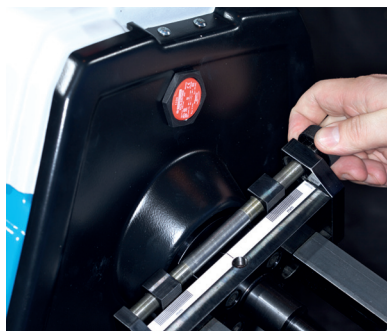
Easily adjustable with one screw

Skiving of hydraulic hoses (external and internal) from dimensions 3/16" to 2". Controlled by a foot pedal.